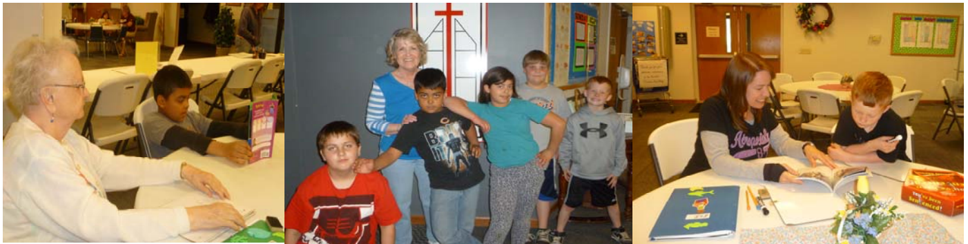
FASTBreak students and mentors