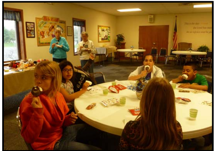
FASTBreak volunteers and students.